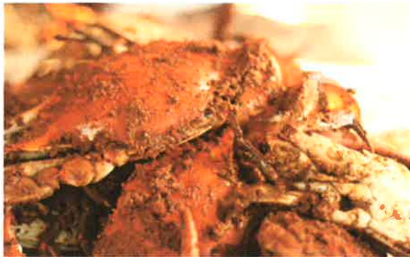
It's a Crab Feast

Harrison Chesapeake House Tilghman, Maryland