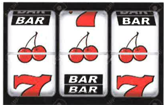
It's a Casino Trip

Delaware Park Casino Wilmington, Delaware