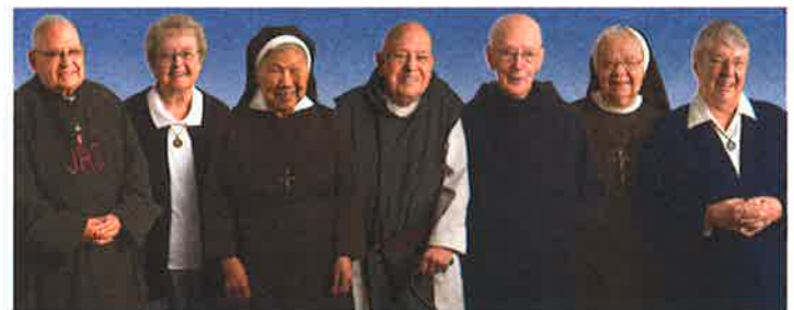
Meet them at retiredreligious.org/2018photos .

Almost 94 percent of donations directly aid senior religious.