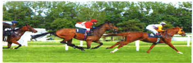
St Wenceslaus Afternoon at the Races